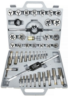
T015 Imperial Alloy Steel Tap & Die Set - 45 Piece