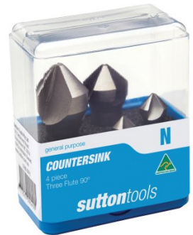
D106 Countersink Sets – 90° Three Flute