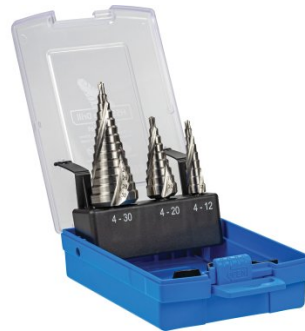
D107 HSS Step Drill Sets