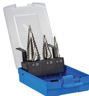
D107 HSS Step Drill Sets