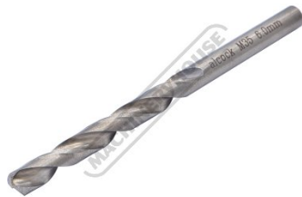
6mm Drill Bit