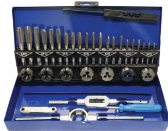
T012 Metric Alloy Steel Tap & Die Set - 32 Piece