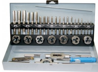
T013 Metric HSS Tap & Die Set - 32 Piece