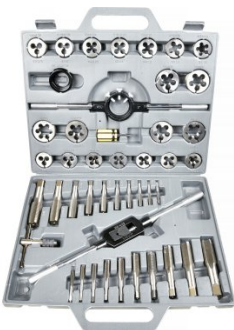
T015 Imperial Alloy Steel Tap & Die Set - 45 Piece