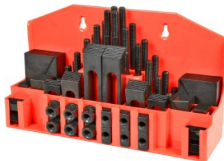
C096A Clamp Kit 58 piece - Industrial Series