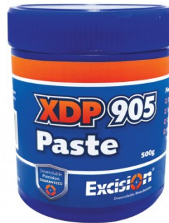
S074 Cutting Tool Lubricant Paste - 500g