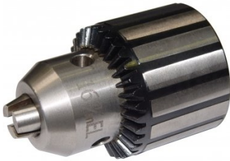
C292 Industrial Drill Chuck - Keyless Type