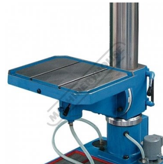
T Slotted Work Table