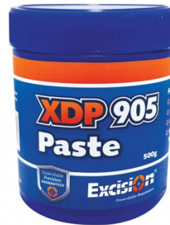
S074 Cutting Tool Lubricant Paste - 500g