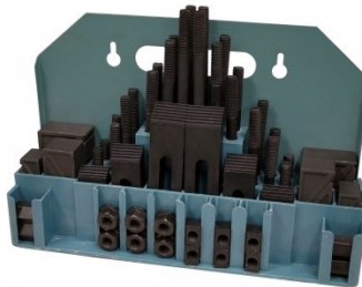
C0965 Clamp Kit 58 piece - Workshop Series