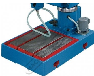
T Slotted Base