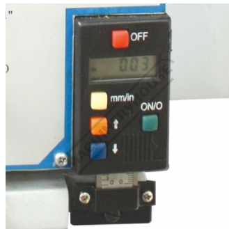
Digital Depth Gauge