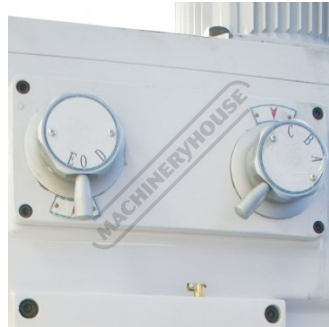
Gear Selection Levers