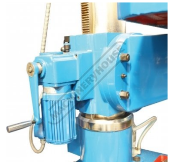
Motorised Rise and Fall Work Table