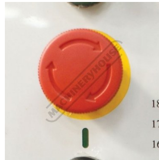
Emergency stop Switch and Overload Protection