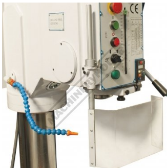
Chuck Guard with Micro Switch and Coolant Nozzle