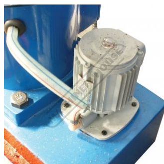
Coolant Pump System