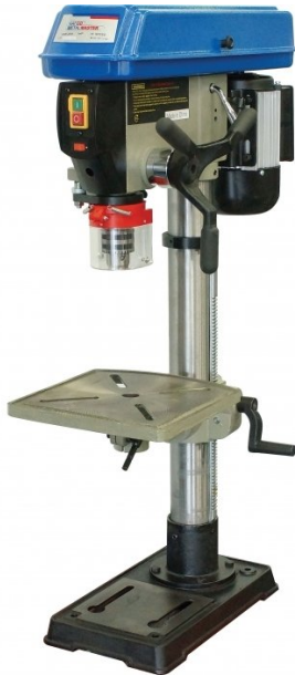
Table Tilts Left & Right To 45° & Rotates Ø20mm Drill Capacity with 2MT Spindle Taper