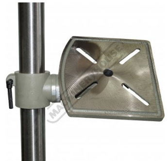
Tilting and Rotating Cast Iron Table