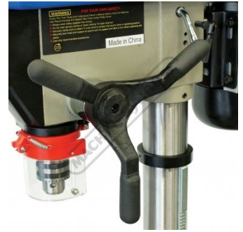
1 Piece Cast Iron Drilling Lever