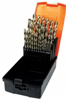
D1282 Imperial 135° Precision HSS Drill Set - 29 Piece