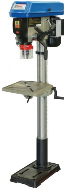
Table Tilts Left & Right To 45° & Rotates Ø20mm Drill Capacity with 2MT Spindle Taper