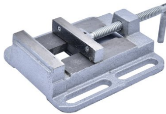
V124 Drill Press Vice