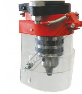
Adjustable Safety Chuck Guard with Flip Up Screen