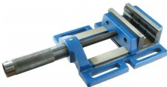
V145 Drill Press Vice