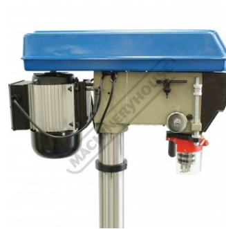
Head Side View