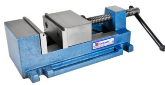
V141 Safeway Precision Drill Press Vice