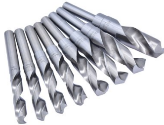
D117 Metric HSS Reduced Shank Drill Set