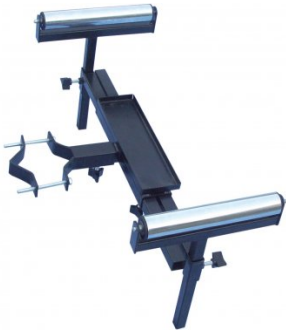
W3425 Drill Press Roller Support