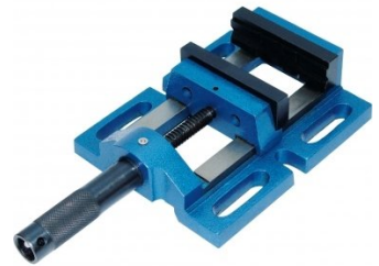
V144 Drill Press Vice