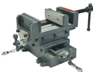
V1205 Compound Drill Vice