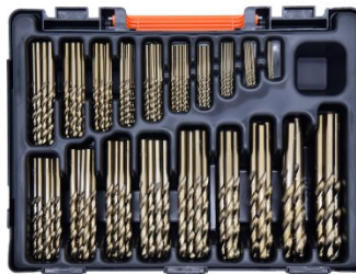
D126 Metric 135° Precision HSS Drill Set - 170 Pieces