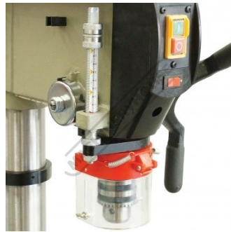
Drilling Depth Stop Setting with Scale