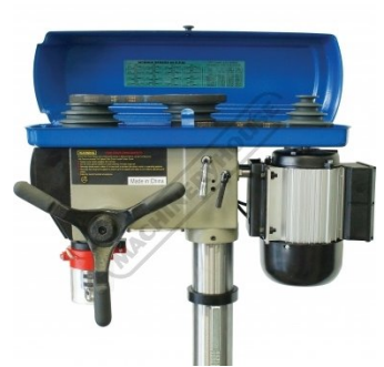
Side View of Head