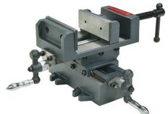
V1204 Compound Drill Vice