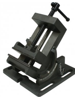
V114 Tilting Drill Press Vice