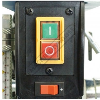
Magnetic Switch and Light Switch