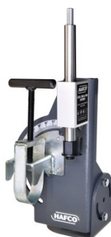
P090 Pipe & Tube Notcher Attachment