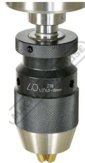
13mm Keyless Drill Chuck