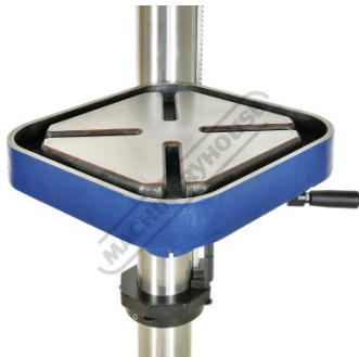
Cast Iron Table Rotates 360 Degree