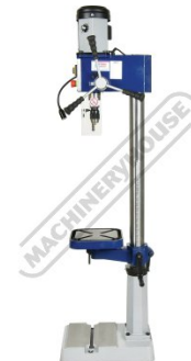
Rack and Pinion Fully Down