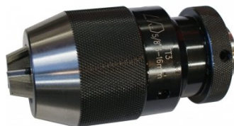
C294 Industrial Drill Chuck - Keyless Type