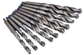
D122 Metric Precision 2MT Morse Taper Drill Set - 10 Piece