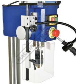
Drill Chuck Safety Guard with Micro Switch