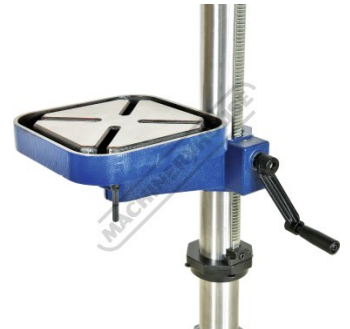
Table with Rack and Pinion Wind Up