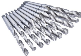
D119 Metric 2MT HSS Drill Set