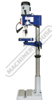
Rack and Pinion Fully Up