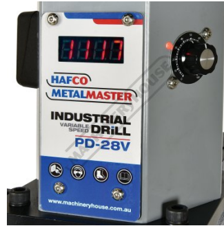
Variable Speed Readout with Adjustable Dial