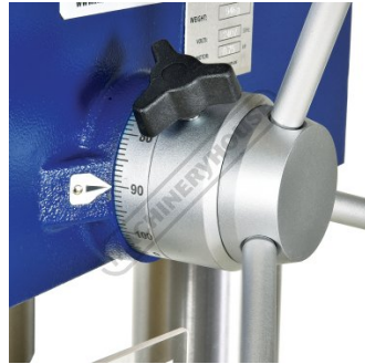
Drill Depth Setting with Scale