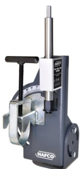
P090 Pipe & Tube Notcher Attachment