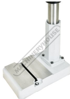
T Slot Base