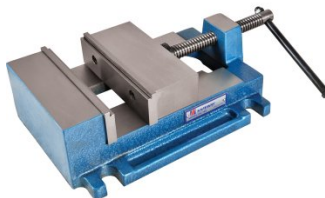
V143 Safeway Precision Drill Press Vice