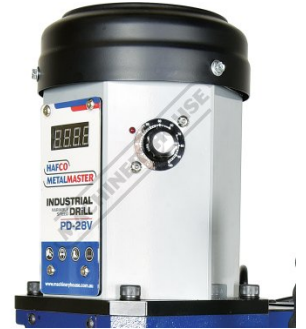
DC Brushless Motor