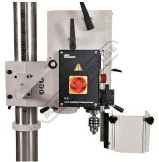
Rack & Pinion Wind Up Drill Head