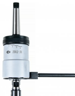
T004 Reversible Tapping Chuck - Adjustable Clutch