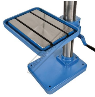
T Slotted Work Table With 360 Degree Rotation