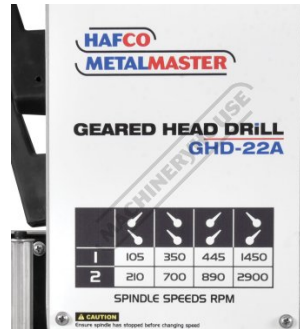
High/Low With Forward & Reverse & Spindle Speeds