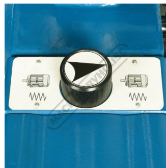
Manual Drive Or Motor Gear Drive Dial