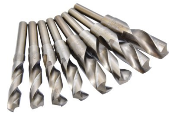
D1181 Imperial Industrial HSS Reduced Shank Drill Set