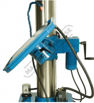
Table Tilts 90 Degrees Left or Right - shown at 45 degrees