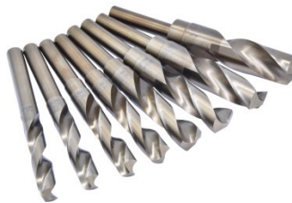
D1171 Metric Industrial HSS Reduced Shank Drill Set