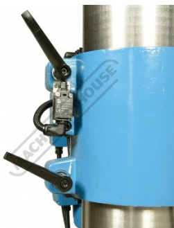
Table Clamps with Safety Micro