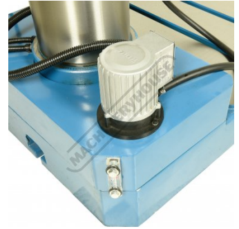
Coolant Pump System