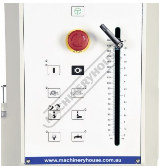
Depth Gauge And Control Panel