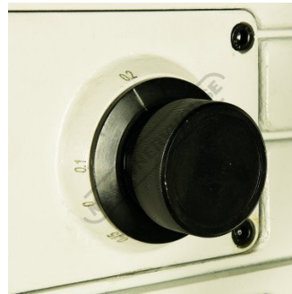
Automatic Feed Selection Dial