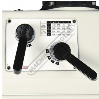
Spindle Speed Selection Levers