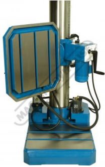
Swivel and Tilting Table