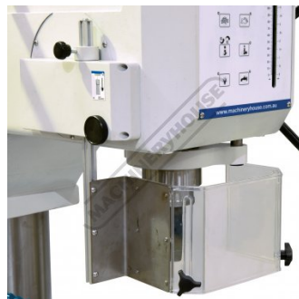
Interlocked Spindle Safety Guard