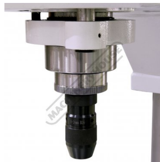
Drill Chuck And Arbor