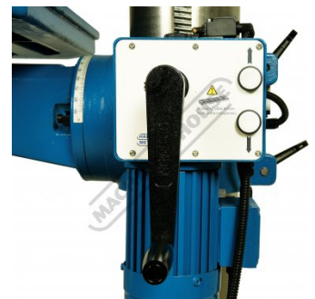
Manual Handle and Up Down Switches for Table Height