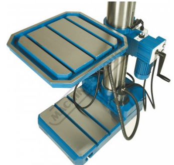
T Slotted Table and Base