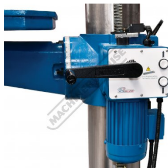
Motorised Rise-Fall Work Table