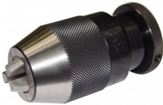
C292 Industrial Drill Chuck - Keyless Type