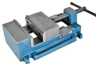
V142 Safeway Precision Drill Press Vice