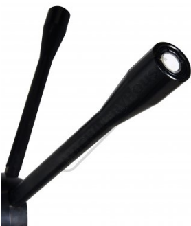
Electronic Feed Engagement