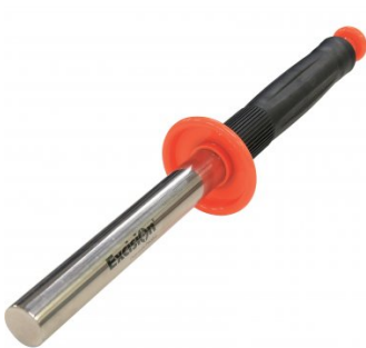
L300 Magnetic Swarf Remover