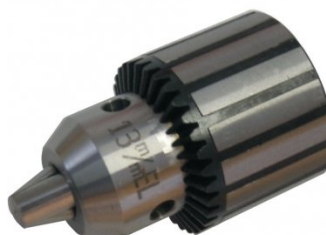
C289 Heavy Duty Drill Chuck - Keyed Type