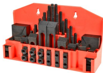
C097 Clamp Kit 58 piece - Industrial Series