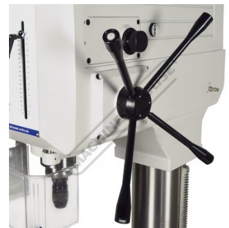
Quill Feed Handle