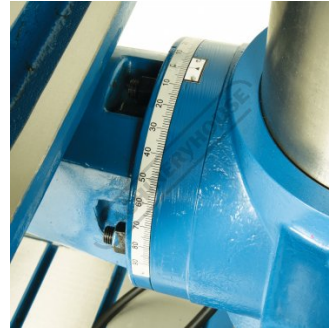
Table Tilt Adjustment Graduations