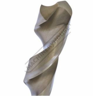
135 Degree Split Point M35 HSS 5% Cobalt