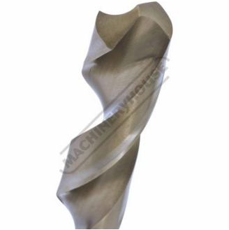
135 Degree Split Point M35 HSS 5% Cobalt