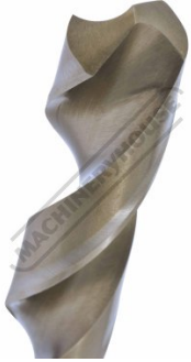
135 Degree Split Point M35 HSS 5% Cobalt