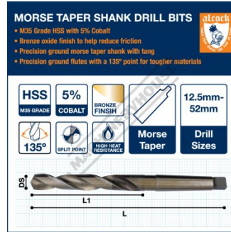
Morse Taper Shank Drill