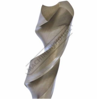
135 Degree Split Point M35 HSS 5% Cobalt