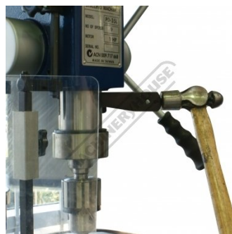
Drill Chuck Being Removed by Drill Drift