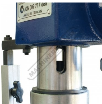
Drill Chuck Set Up For Removal