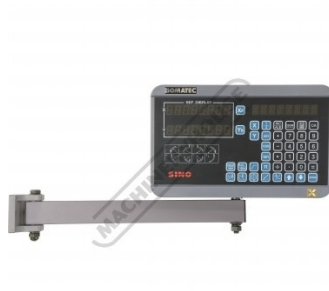
Shown Mounted to Optional DRO Front View