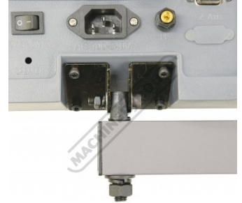
Mounting Close Up with Optional DRO