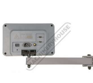
Shown Mounted to Optional DRO Rear View