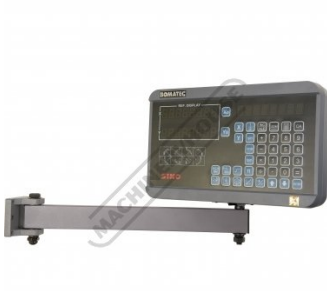
Shown Mounted to Optional DRO