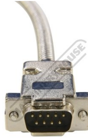
DSub9 Male Plug