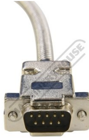
DSub9 Male Plug