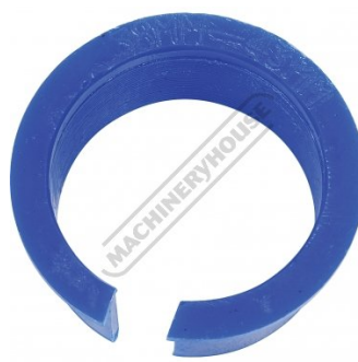
38mm Collar Reducer Insert