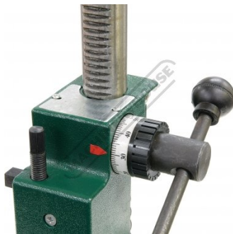
Rack and Pinion Quill Mechanism