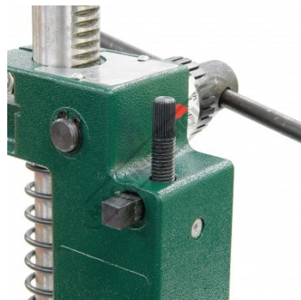
Drill Depth Stop Adjustment Screw