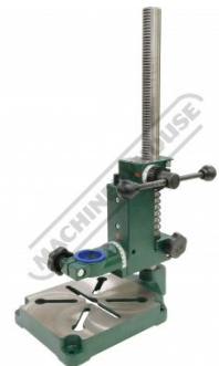
Head Full Down