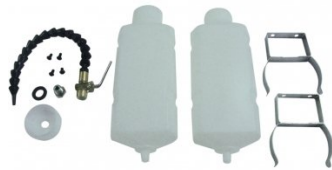
S090A Soluble Metal Cutting Fluid - 1 Litre