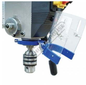
Safety Chuck Guard Flipped Up