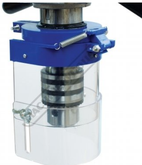
Adjustable Safety Chuck Guard with Flip Up Screen