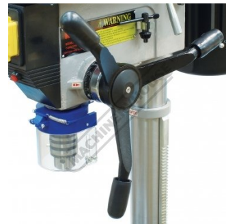
1 Piece Cast Iron Drilling Lever