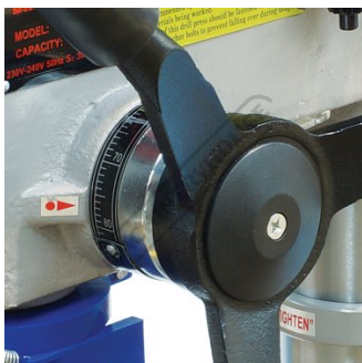
Drilling Depth Stop Setting With Scale