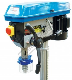
80mm Spindle Travel