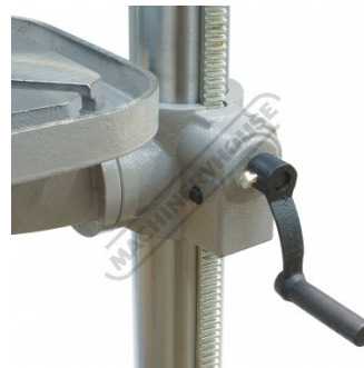
Table Height Adjustment Crank