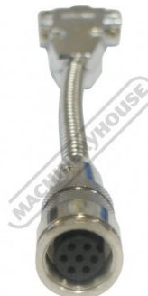
DIN7 Female Plug