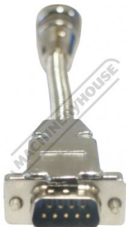
DSub9 Male Plug