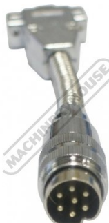
DIN7 Female Plug