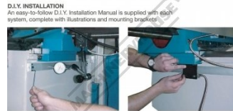
DIY INSTALLATION An easy-to-follow DIY Installation Manual is supplied with each system, complete with illustrations and mounting brackets.