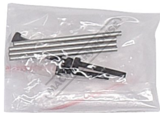
Aluminium Extrusion Joiner Pins