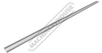
Aluminium Extrusion Length