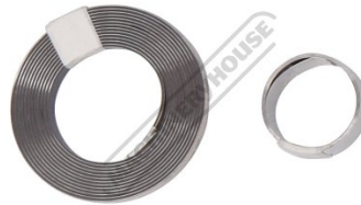
Magnetic Tape and Metal Protective Strip