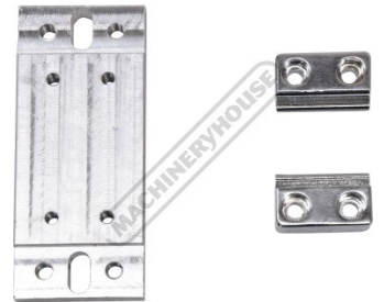
Scale Holder Bracket