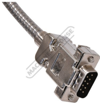
Dsub 9 Male Plug