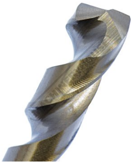
135 Degree Split Point M35 Grade HSS 5% Cobalt