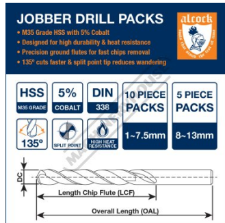
Jobber Drill Packs