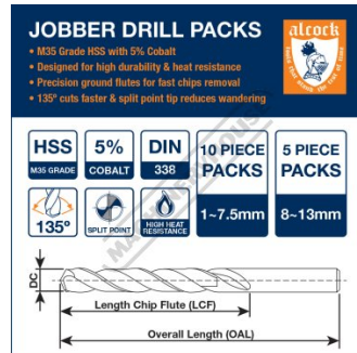
Jobber Drill Packs