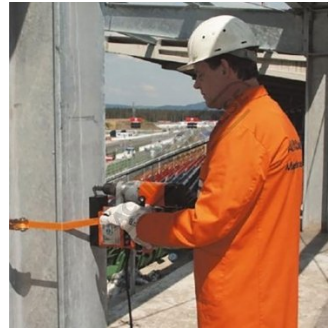
Shown in Action on Job Site