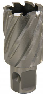
D9528 HSS Drill Broach Cutter