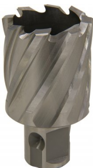
D9534 HSS Drill Broach Cutter