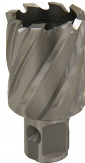
D9532 HSS Drill Broach Cutter