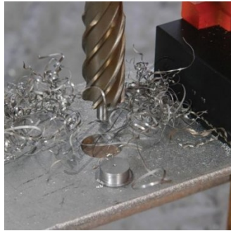
Shown in Action