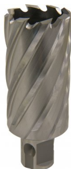
D9572 HSS Drill Broach Cutter