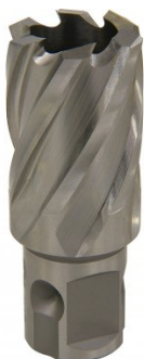
D9524 HSS Drill Broach Cutter