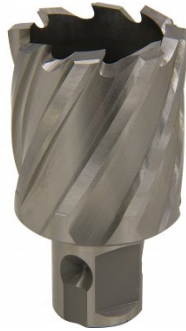
D9534 HSS Drill Broach Cutter