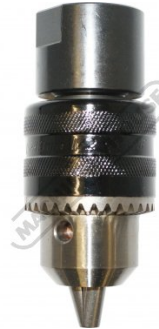
Includes Drill Chuck