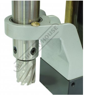
Shown with Optional Broach Cutter