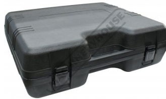
Durable Plastic Case