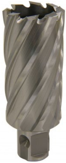
D9570 HSS Drill Broach Cutter