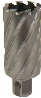
D9572 HSS Drill Broach Cutter