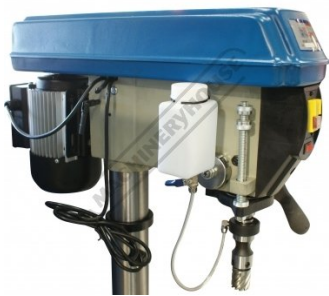
Shown Mounted to Drilling Machine