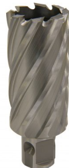
D9570 HSS Drill Broach Cutter