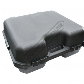
Durable Plastic Case