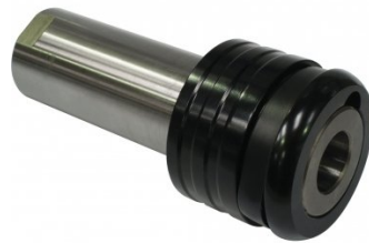
D9504 Quick Release Chuck - Broach Cutter Adaptor