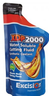
S090A Soluble Metal Cutting Fluid - 1 Litre