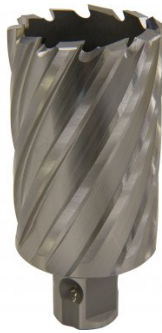
D9578 HSS Drill Broach Cutter