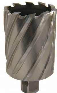
D9582 HSS Drill Broach Cutter