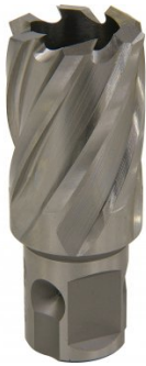
D9524 HSS Drill Broach Cutter