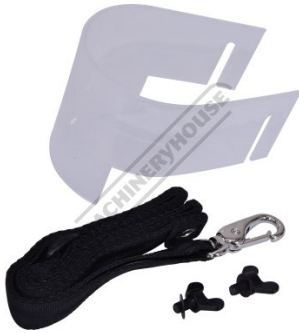
Included Safety Guard Strap