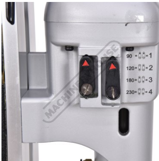
Four Speed Gearbox