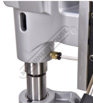
Through Spindle Coolant Feed