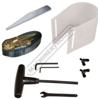
Tooling and Parts