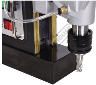
Quick Release chuck Cutter Not Included