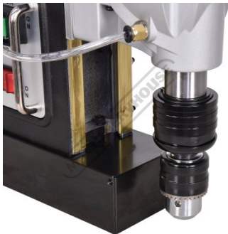
Includes Drill Chuck