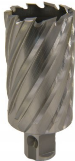
D9576 HSS Drill Broach Cutter