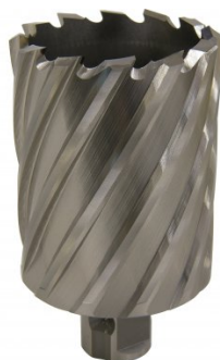
D9584 HSS Drill Broach Cutter