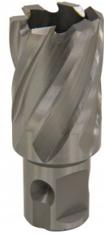
D9525 HSS Drill Broach Cutter