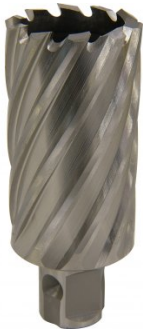
D9574 HSS Drill Broach Cutter