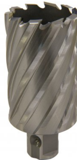
D9578 HSS Drill Broach Cutter