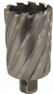
D9580 HSS Drill Broach Cutter