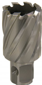
D9530 HSS Drill Broach Cutter