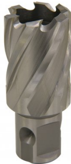
D9526 HSS Drill Broach Cutter