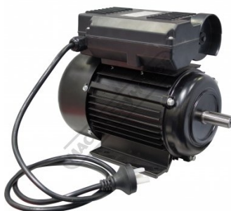
Shown with Lead