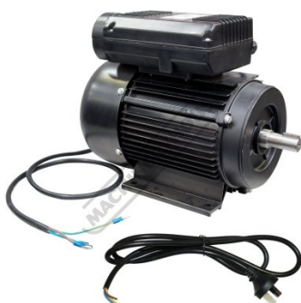
Shown with Lead