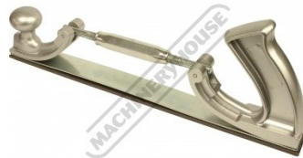
Shown With Optional File