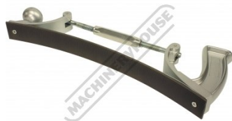
Shown with Optional File Bottom View Angle