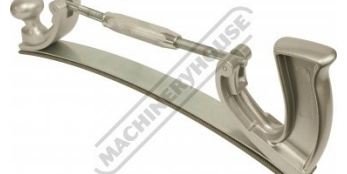
Shown with Optional File Top View Angle