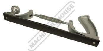
Shown with Optional File Bottom View