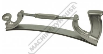
Shown with Optional File Top View