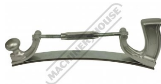
Shown with Optional File Front View Angle