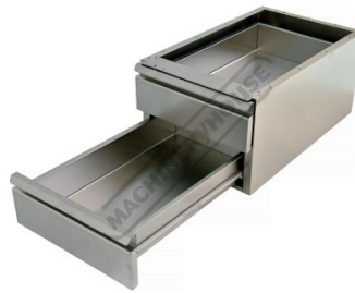
Large Draw Opening