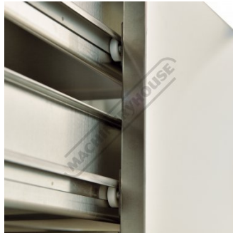
Nylon Roller Bearing Slides