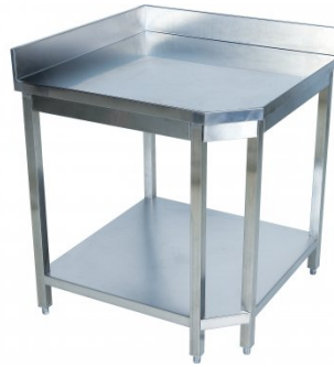
F305 Stainless Steel Corner Work Bench