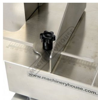
Length Stop Graduations