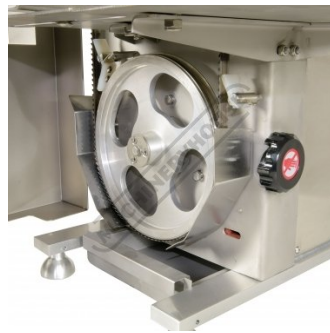
Bottom Blade Wheel Setup