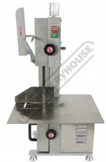
Side View Guard Up