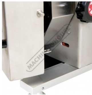
Safety Micro on Blade Guard