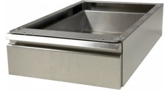
F310 Stainless Steel Drawer Unit - Single Drawer