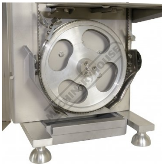
Bottom Blade Wheel