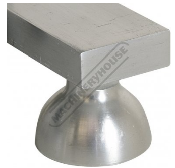
Stainless Steel Feet