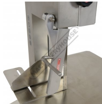
Blade Guard Down