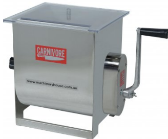
F340 Mince Mixer - Stainless Steel