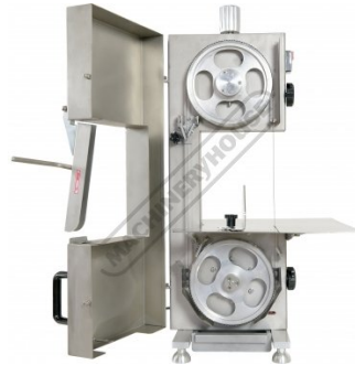
Side View With Blade Guard Open