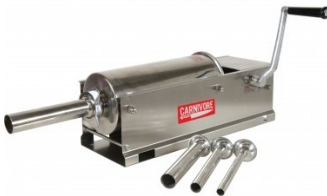
F355 Sausage & Salami Filler / Stuffer 5 Litre - Stainless Steel