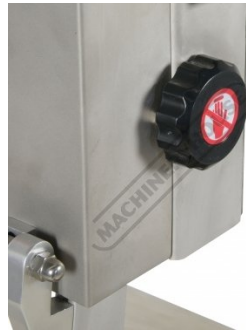
Blade Guard Door Handle