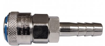
F945 High-Flow One Touch System Air Fittings