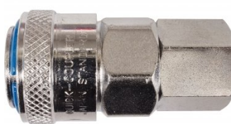
F940 High-Flow One Touch System Air Fittings