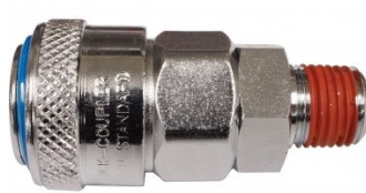
F941 High-Flow One Touch System Air Fittings