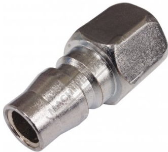
Hi Flow Adaptor