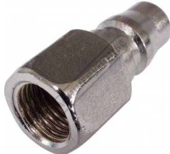
1/4" BSP Female End