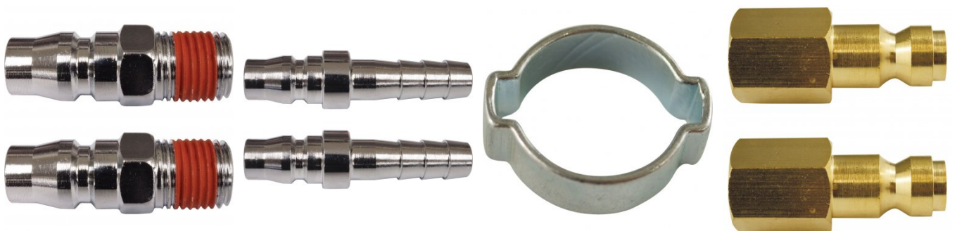
F903B Air Fittings