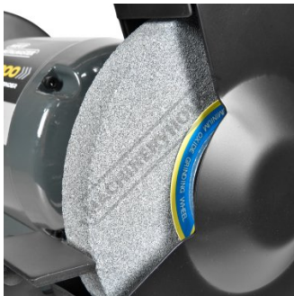
Coarse Aluminium Oxide Grinding Wheel