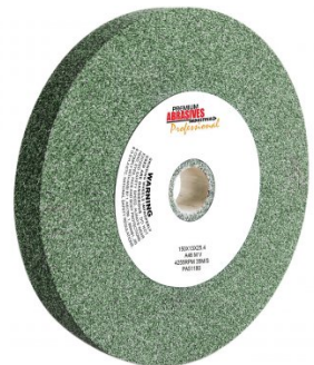
G170 Silicon Carbide Grinder Wheel