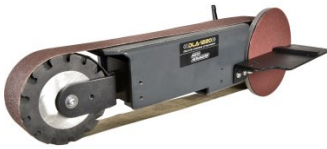
L0931 Deluxe Belt & Disc Linishing Attachment