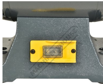
On Off Switch