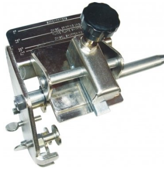
L083 Multitool Chisel Sharpening Jig