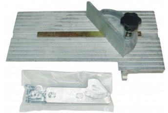
L086 Multitool Tilting Table & Mitre Guide