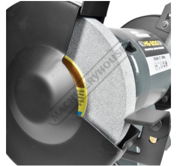
Fine Aluminium Oxide Grinding Wheel