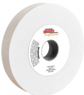
G171 White - Alox Grinder Wheel