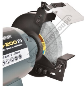
Adjustable Eye Shield-Tool Rest