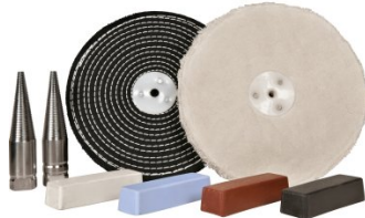
G1855 Buffing Kit