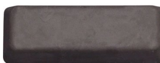
G323 Grey Buffing Compound