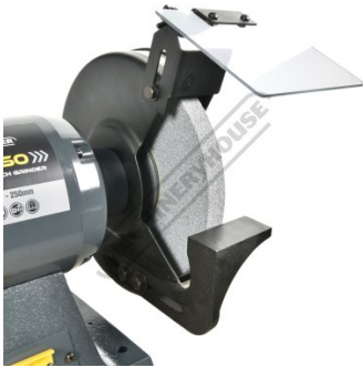
Eye Shield and Tool Rest