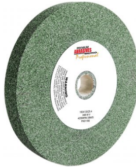
G170 Silicon Carbide Grinder Wheel