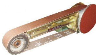
L088 Multitool Belt & Disc Linishing Attachment