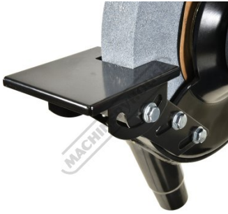
Tool Rest Dust Chute