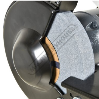
Fine Grinding Wheel