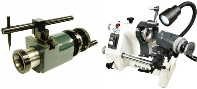
G1975 Universal D BIT Grinder