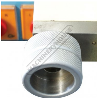
Longitudinal Feed Dial