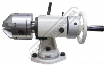
Drill Grinding Attachment