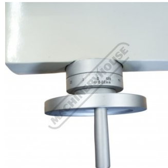
Cross Feed Dial