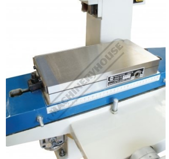
Fine Pole Magnetic Chuck