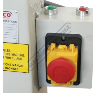
Start & Stop with Emergency Stop